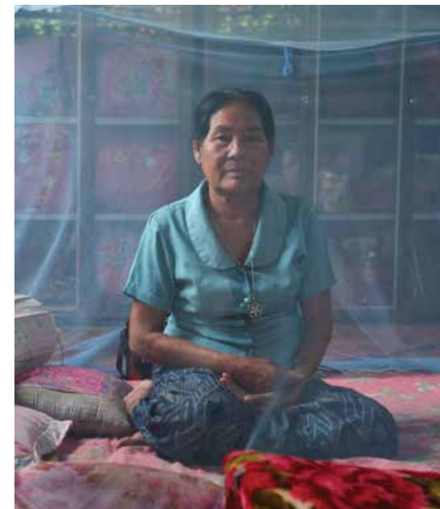
A resident from Xiengwang village, Lao PDR with long-lasting insecticidal bed net that she received through LLIN distribution campaign.

The RAI grant funding has been used to purchase key malaria commodities, including vector control, diagnostics and quality-assured drugs; develop surveillance systems, support case management by community health workers, and build resilient and sustainable health and community systems.